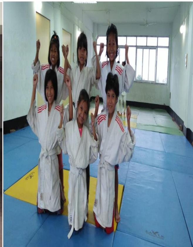
Judo players (Girls)