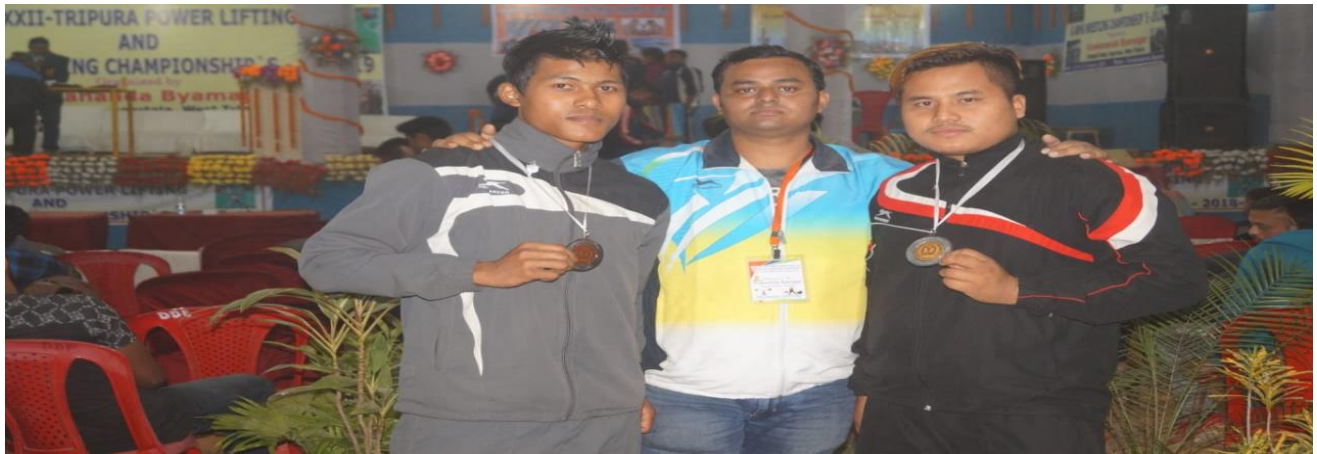
Weight lifting players and their coach

10(Ten) Students Boys under going training at Khumulwng Weight Lefting Centres. They are being provided Tiffin daily @ Rs.20/- per trainee necessary dresses for Weight Lifting trainees are being provided time to time. Achievement: State level competition of Weight Lifting held at Agartala on 24/01/2019 and participate two players and own to silver prize.